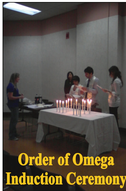
Order of Omega Induction Ceremony

April 27 (Tuesday) @6 - 9:30AM Buffalo News Kid's Day